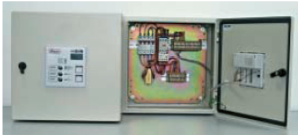
IP3 DOL Starter Panel – Includes: IP55 Enclosure, MCB, Magnetic Contactor and TOR