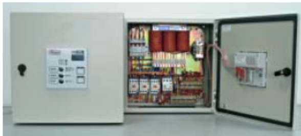
IP3 AT Starter Panel – Includes: IP55 Enclosure, MCB, Magnetic Contactors, TOR and AT