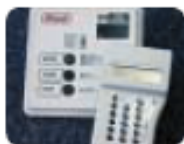
IP3 Panel Controller