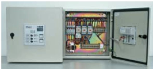
IP3 SD Starter Panel – Includes: IP55 Enclosure, MCB, Magnetic Contactors and TOR